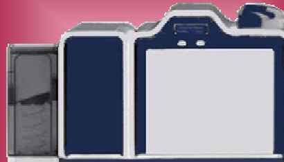
M3300 Single-Side Printer M3400 Dual-Side Printer